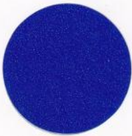
235 Yamaha Blue