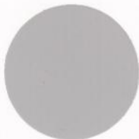
HD 7035 Light Grey