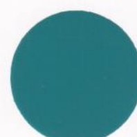
245 Motor Green