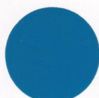
242 River Blue