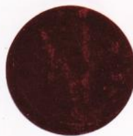
236 Honda Red