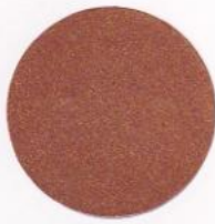
302 Pink Gold