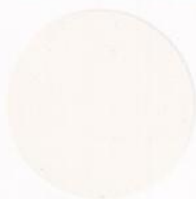
M 201 Flat White