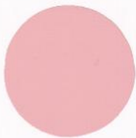
F2 Fluorescent Red