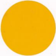
000 Primer for Gold