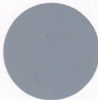
HD 7001 Silver Grey