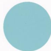
224 Sky Blue