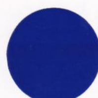
244 Motor Blue