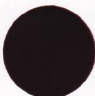
265 Cocoa Brown