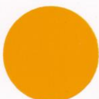
241 Medium Yellow