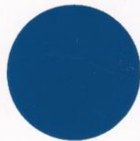
238 Ford Tractor Blue