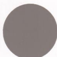
221 Light Grey