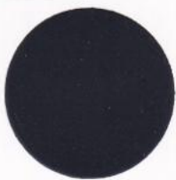
M 212 Flat Black