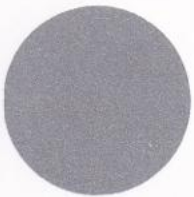
HI-102 Hi-Temp Metallic Silver