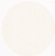
HD 9003 Signal White