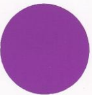
F8 Fluorescent Violet