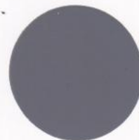
220 Medium Grey