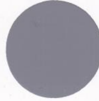
257 Primer Surface