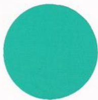
F5 Fluorescent Green