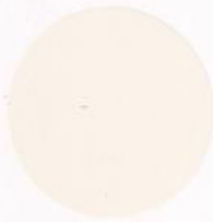
M 232 Clear Matt