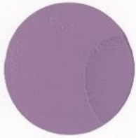
F6 Fluorescent Pink