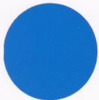
F7 Fluorescent Blue