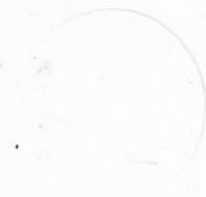
F1 Fluorescent White