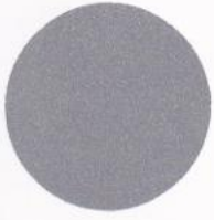
M-100 Candy Tone Undercoat