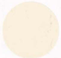
999 Acrylic Clear Gloss