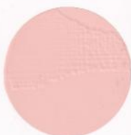
F4 Fluorescent Orange