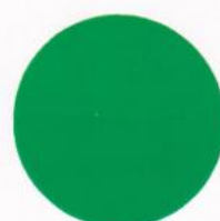
217 Apple Green